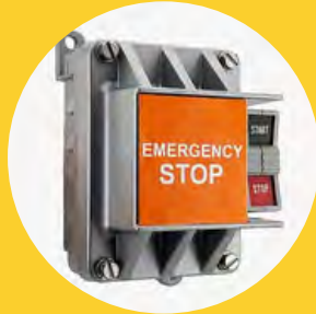
ROCKER SWITCH EXPLOSION PROOF