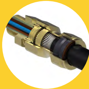
FLAME & EXPLOSION PROOF CABLE GLAND