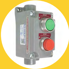
EXPLOSION PROOF PUSH BUTTON SWITCH