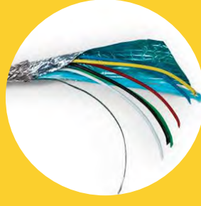
INTRINSICALLY SAFE CABLE